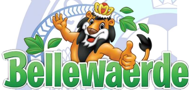
Amusement park Bellewaerde (Ypres) and Walibi (Wavre) 88 km