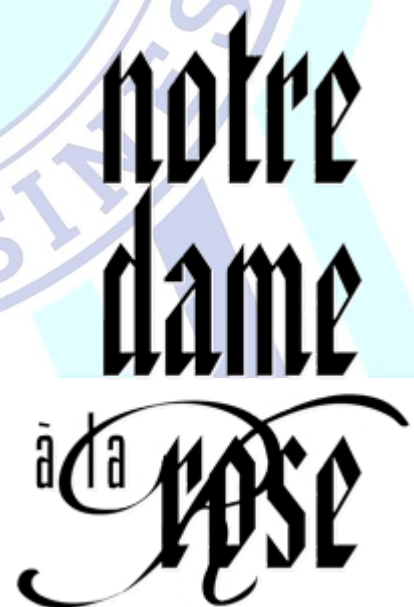
Notre Dame à la Rose 5 km