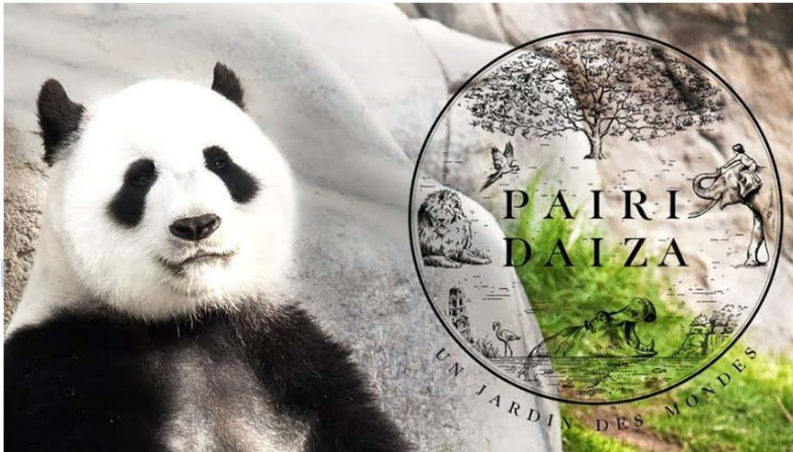
Pairi Daiza 17 km Best Zoo in Europe in 2018