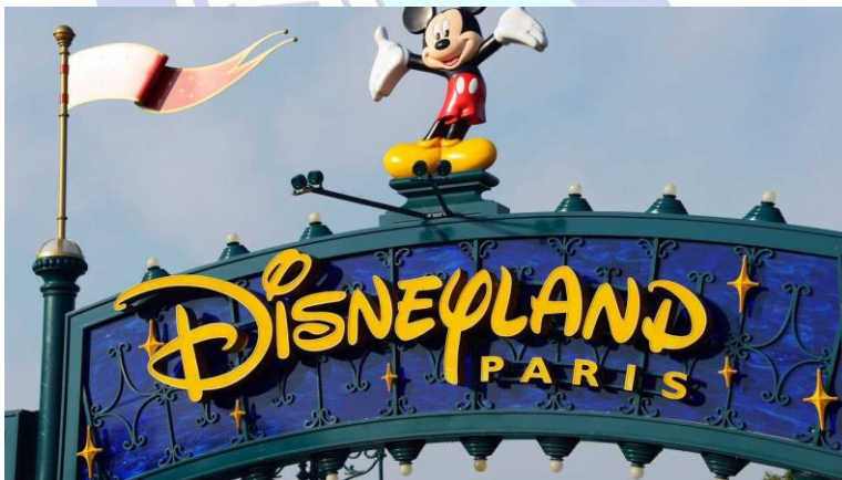
Amusement park Disneyland Paris 290 km